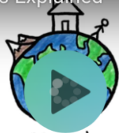
Plate Tectonics Explained